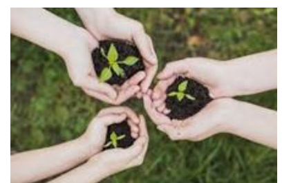
Inclusion and Environmental Responsibility