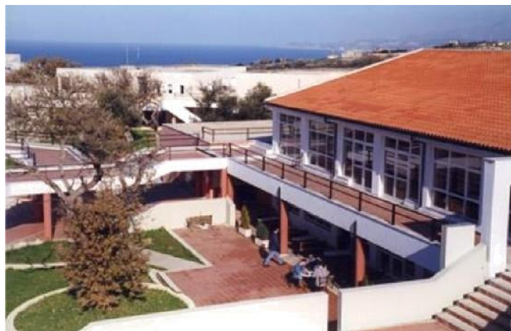
Pic 1: eLearning Lab

eLearning Lab Location: University of Crete, eLearning Lab, Department of Primary Education, 74100 Rethymno (Pic 1)